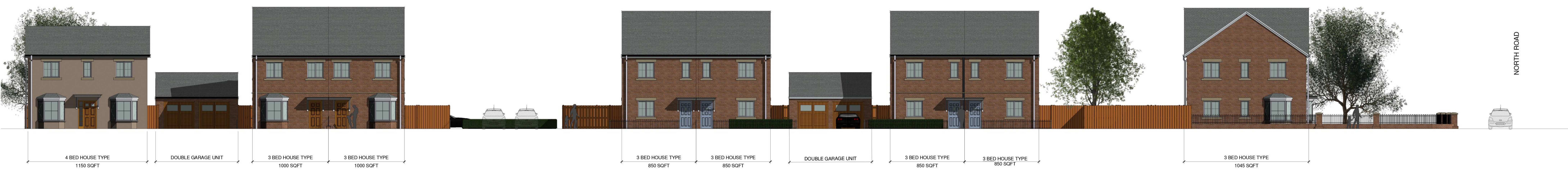
1 NORTH FACING SECTION A 1 : 100