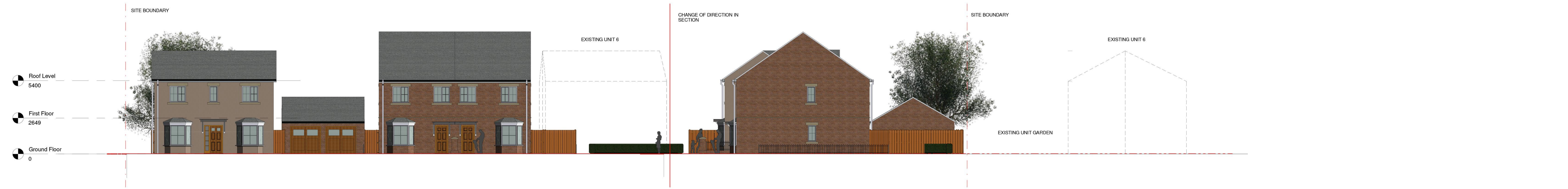
3 SECTION - C 1 : 100